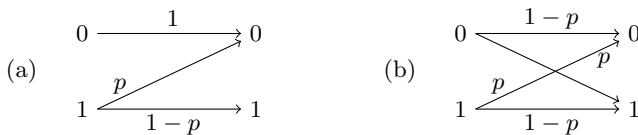
Fig. 1. A Z-channel (a) and a standard Binary Symmetric Channel (b)

In the following, we use the name Z-channel to refer to a binary Z-channel, where (x_1, x_2) = (0, 1) and (y_1, y_2) = (0, 1) . Using these symbols, the behavior of the Z-channel closely resemble that of a binary symmetric channel, except for the fact that the noise is affecting the communication asymmetrically (see Fig. 1). In practice, we can transmit a “0” through the channel noiselessly, while sending a “1” we have a probability p that it will be received as a “0”.